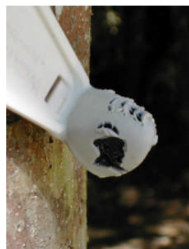
Possum bite marks