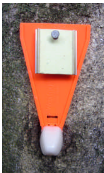
WaxTag & GloTag