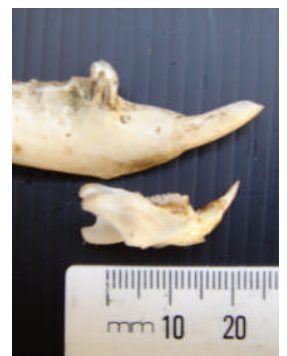
Possum and rat jaws

BAITS, TRAPS & OTHER SUPPLIES www.pestcontrolresearch.co.nz