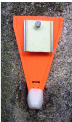
WaxTag & GloTag