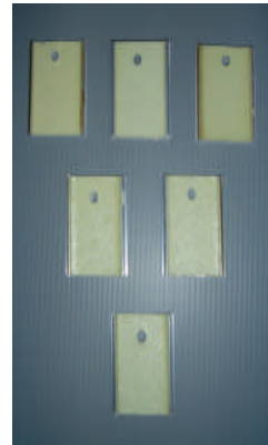
GloTag by day