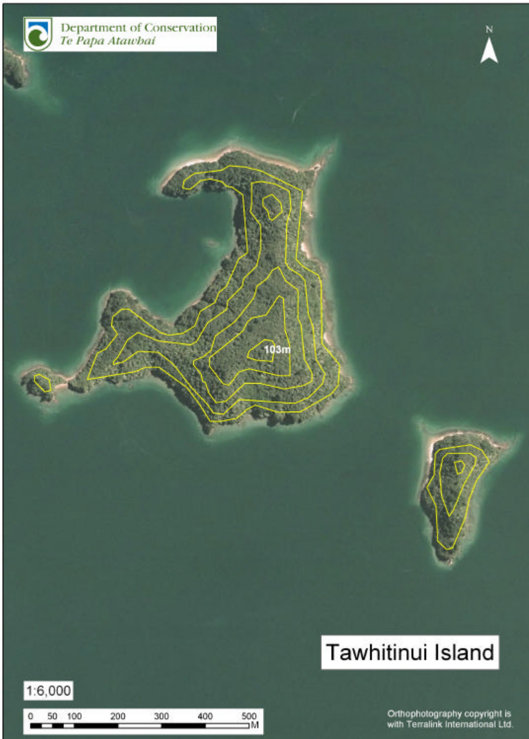
Fig. 1: Aerial photograph of Tawhitinui & Awaitei showing contours and height at summit.