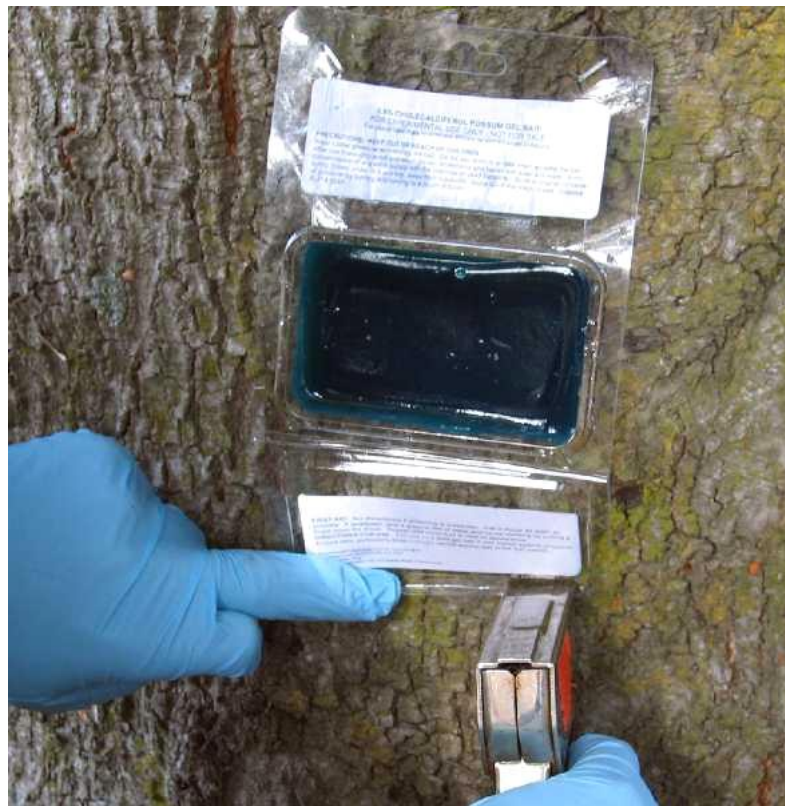
Fig. 2 Cholecalciferol gel bait, prepackaged in a plastic bait station being stapled to a tree.

Post-control monitoring was carried out during 21-23 July 2005 following the same procedures, except that all possums were killed, and recapture of ear-tagged animals was recorded.