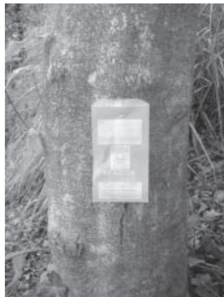
Figure 1. Bait bag used to deliver Feratox®. Space is provided on the bag for the address of the possum control operator.

Bait stations are plastic containers that can be attached to trees. They reduce bait interference by non-target species and protect the baits from rain. Bait stations placed at regular intervals are a proven method for killing possums in native forest (Thomas 1994; Thomas et al. 1996). Research using non-toxic rhodamine-dyed baits fed for 3 weeks showed that 87% and 81% of possums used the bait stations when they were spaced in 100 m × 100 m and 150 m × 150 m grids, respectively (Thomas & Fitzgerald 1995).