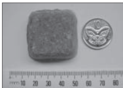
Figure 2. A Feracol® Block bait (left) and a Feracol® Sentinel bait (right), each containing 0.8% wt/wt cholecalciferol.

Blocks and Sentinels (Fig. 2) are new bait delivery methods developed by Connovation Ltd and both are manufactured using the same bait formulation. It consists of a mix of vegetable fat, sugar and ground cereal and has waterproof qualities making it long-lasting in the field. Manufacture of these baits is undertaken by melting the mix and pouring it into moulds. The Blocks consists of a 40 × 40 × 20 mm, 20 g square and the Sentinel consists of a 150 × 50 mm, 300 g cylinder. The Block is designed to fit inside bait stations or bags, and the Sentinel is encased in a cardboard cylinder that can be stapled directly to trees. Both Blocks and Sentinels can contain either Feratox® or cholecalciferol. No research results are available to evaluate the relative efficacy of these products.